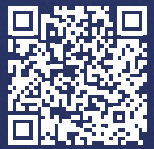
RUT955 360° VIEW